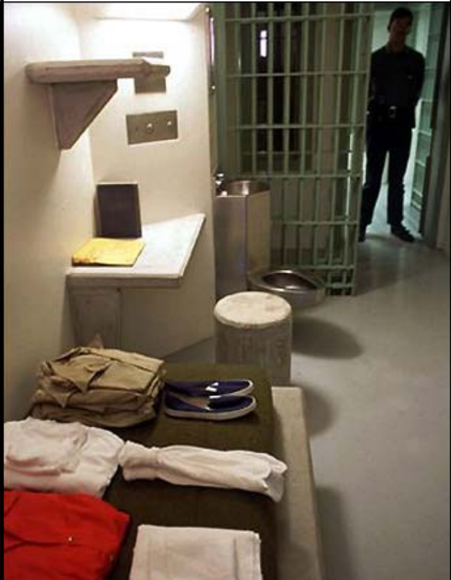
Photo of a typical cell at Supermax Living quarters for 1 prisoner. (84 sq feet per person) 1 person per room—Indoor toilet